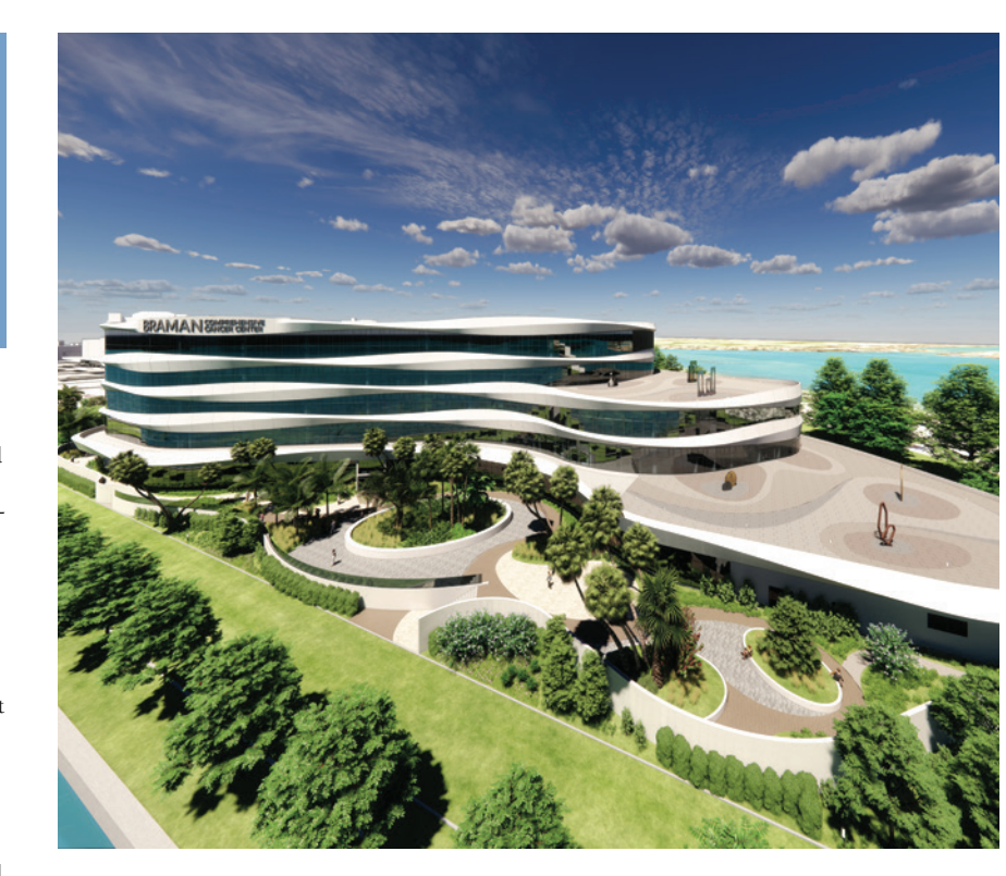
endering of the Braman Comprehensive Cancer Center, set to be completed in 2025.

That hope is becoming a reality. benefiting the greater Miami community.